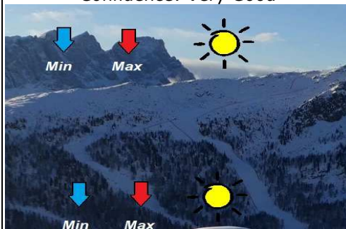
Wednesday 20 Confidence: Very Good