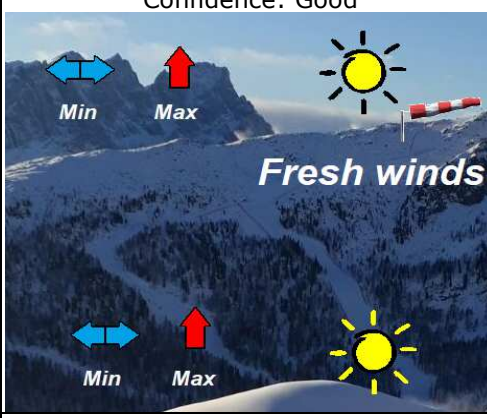
Sunday 24 Confidence: Good