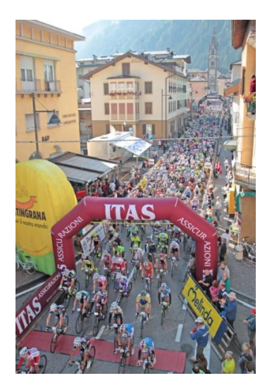
The start is as usual in the centre of Predazzo.

The cyclists ride across all villages in Val di Fiemme, reaching the South Tirol, through the San Lugano Pass.